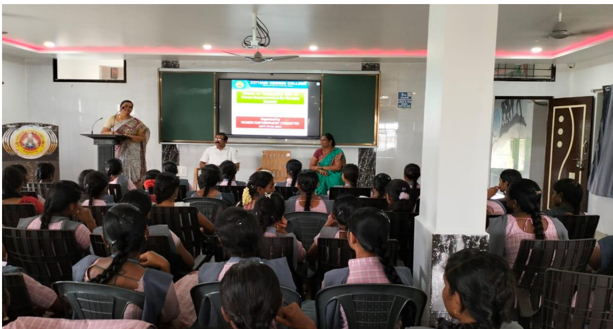
Employability Skills for Women Empowerment