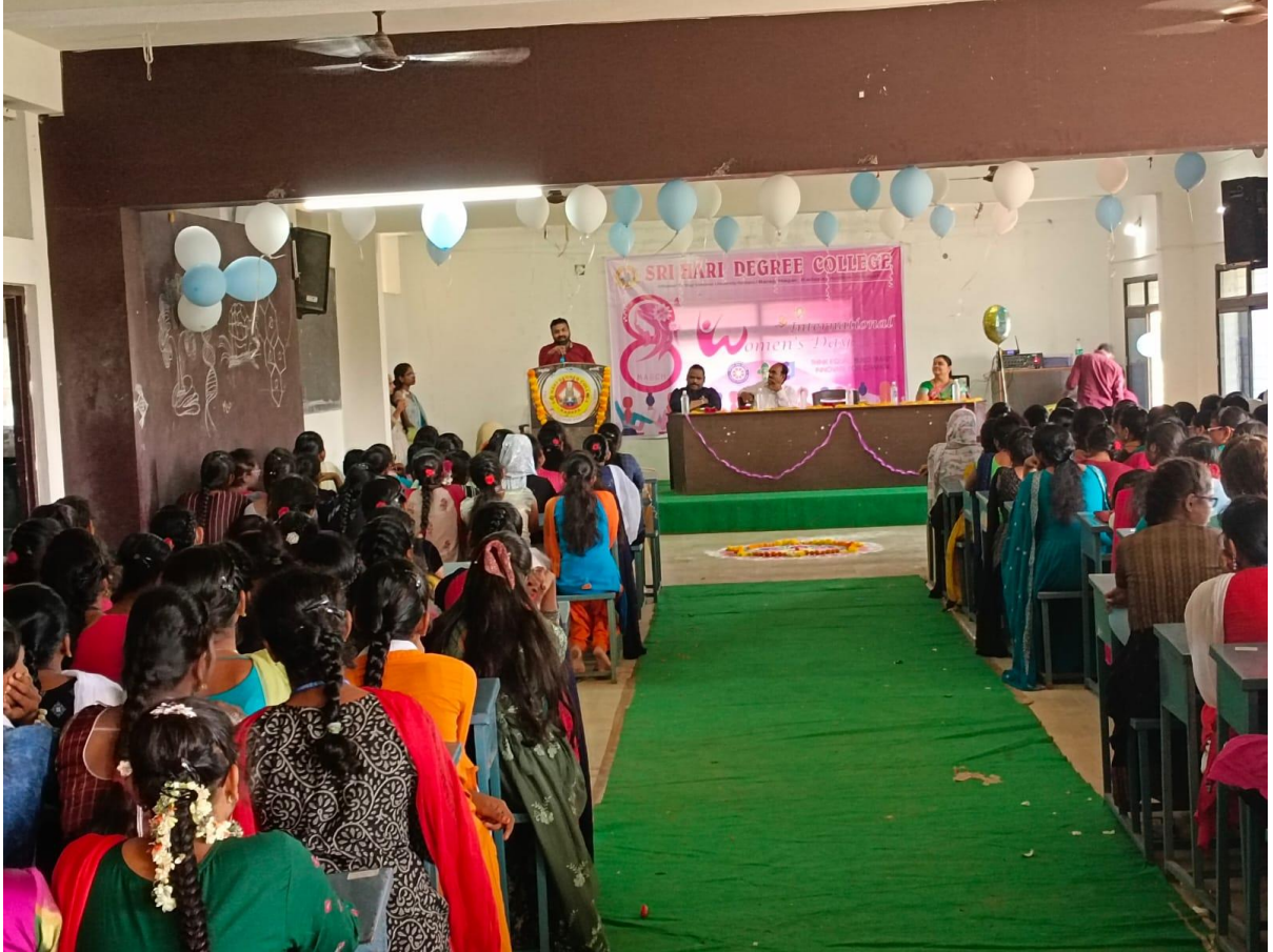
International women's day celebrations 2023